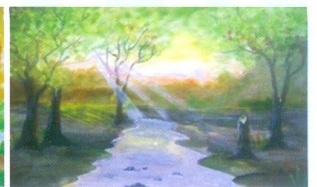
M.K. Muthu Prasath - X C