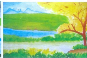
Basu S.S. Nair - X B