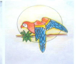
Shobith - IX B