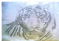
S. Tejaswini V B