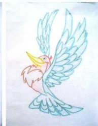
A. Dharshini - VII C