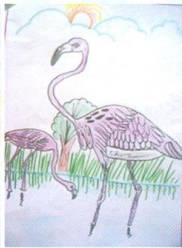
S. Preetha Sanju - VII C