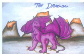
C. Logasree - VII C