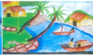
S. Prajesh - VII A